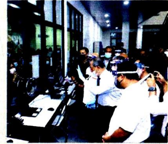
Muhyiddin melawat dan bertemu dengan pesakit yang sedang dirawat di Pusat Kuarantin dan Rawatan Covid-19 Berisiko Rendah (PKRC) pada Selasa.

Hospital itu yang terletak di Dewan B menyediakan fasiliti yang sama dengan hospital lain, dilengkapi 30 katil bagi pesakit kategori tiga dan empat, selain sebuah khemah di luar dewan untuk kes transit unit rawatan rapi dengan 10 katil. - Bernama