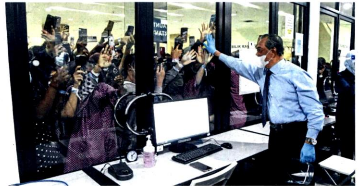
So near yet so far: Muhyiddin meeting with Covid-19-positive patients during his visit to MAEPS 2.0 in Serdang.

The PKRC MAEPS 2.0 will also receive Covid-19 patients in categories one and two who have recovered from categories three, four and five while being treated at hospitals, as well as patients from Johor, Melaka, Negeri Sembilan and the Klang Valley.