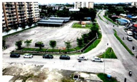
The Puchong Permai Hawker Centre sited between the flats and playground is strategically located along the main road of Persiaran Puchong Permai.

"We hope the hawkers who are relocated here will benefit from the facilities offered.