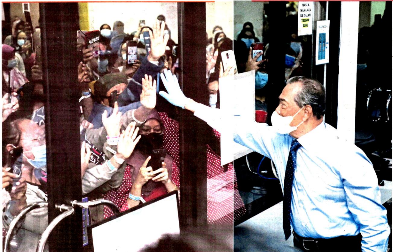
Prime Minister Tan Sri Muhyiddin Yassin waving to Covid-19 patients at the Covid-19 Quarantine and Low-Risk Treatment Centre in the Malaysia Agro Exposition Park Serdang 2.0 Integrated Hospital in Serdang yesterday.